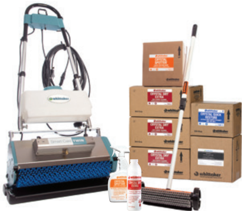
Whittaker Smart Care® Carpet System