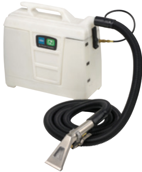
Nobles® EX-SPOT-2 Spotter