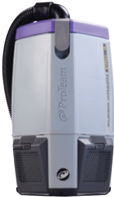
ProTeam Super Coach Pro® Backpack Vacuum