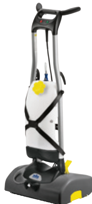
Windsor Karcher iCapsol Mini Deluxe