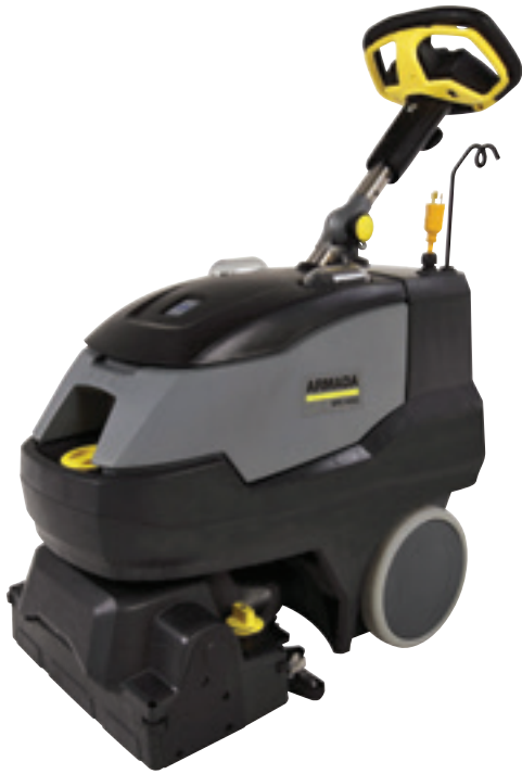
Windsor Karcher Armada™ BRC 40/22 Carpet Extractor