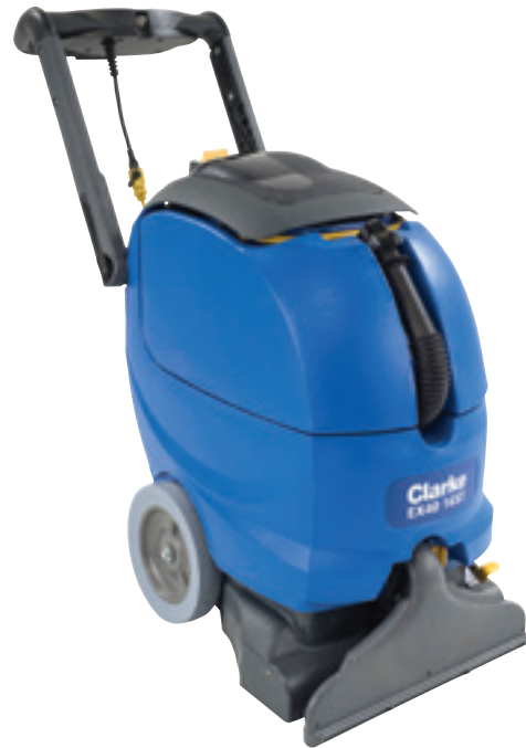
Clarke® EX40 Carpet Extractor